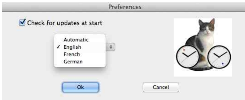
Figure 3: The preferences dialog

Note that by using the menu GizmoDateCalculator → Preferences you access the Preferences dialog (see figure [3]) which allows you to choose the language of the interface: